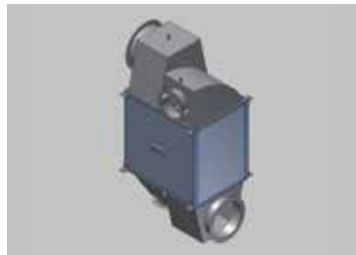
Plate heat exchanger with creative routing of airflow